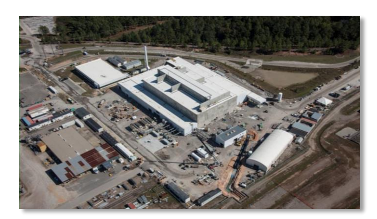
Complete construction, ramp up startup testing and commissioning of the Salt Waste Processing Facility in South Carolina.

Construction activities for the Low Activity Waste Facility, Analytical Laboratory, and Balance of Facilities to support the startup for the Direct Feed Low Activity Waste by 2022 at the Waste Treatment and Immobilization Plant at the Hanford Site in Washington State.