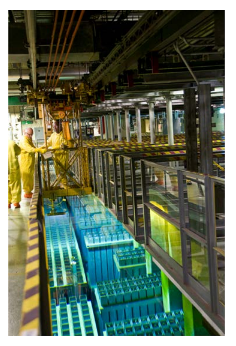
Figure 3. Spent Nuclear Fuel Storage in the Vertical Tube Storage area at the L Basin (from Hixson 2015).

Historically, SNF from the five nuclear material production reactors at SRS was processed in the F Canyon and H Canyon chemical separations plants to recover plutonium and other materials. In September 2014, DOE began a new processing effort at H Canyon to dissolve 3.3 MTHM of aluminum-based SNF from the L Basin and recover highly enriched uranium to be isotopically diluted and used to fabricate fresh fuel for commercial nuclear reactors. DOE plans to complete processing this SNF by Fiscal Year 2024 (Lofton 2019). This processing will reduce the SNF inventory in the L Basin, which will allow SRS to continue to accept and store foreign and domestic research reactor SNF and other SNF that is of concern for proliferation reasons.