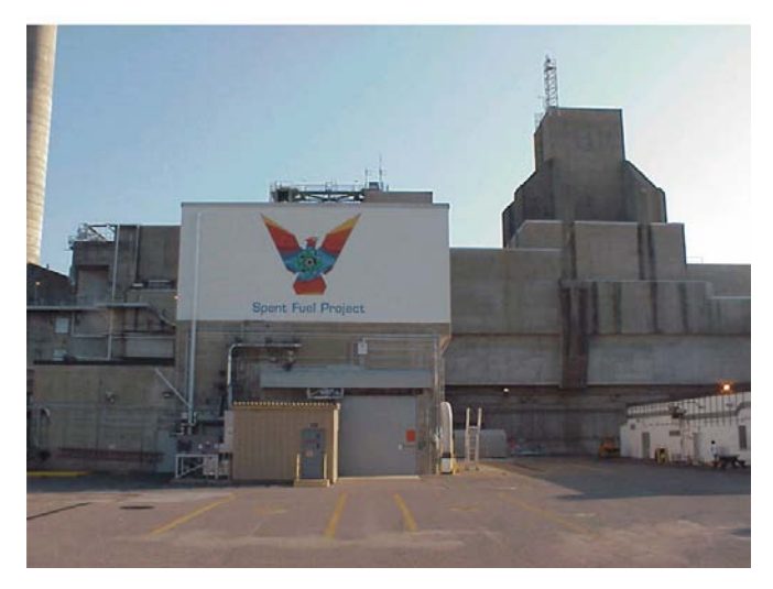
Figure 2. L Basin Building (from Hixson 2015).

L Basin is divided into an upper (North) and a lower (South) basin. The upper basin is mostly 30-ft (9.1-m) deep and includes the vertical tube storage area that contains bundles of SNF (Figure 3). It also includes the dry cave basin, machine basin, and emergency basin